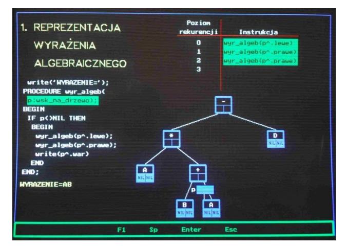
Figure 3. A screen with Package EI - demonstration of a tree data structure

In our vision, when we were designing and implementing Package EI, similarly to Seymour Papert [Papert, 1980]: the student programs the computer instead of the computer is being used to program the student .